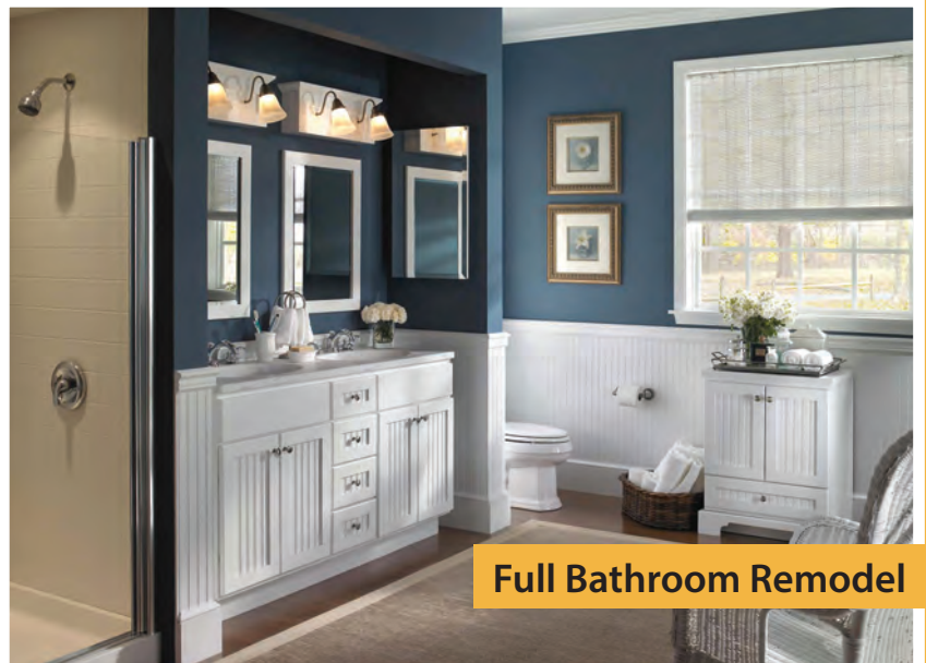
Full Bathroom Remodel